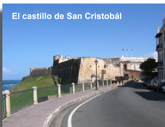
El castillo de San Cristobál

Recent statistics indicate 113 reported TB cases in Puerto Rico during 2005. This translates to 2.9 cases per 100,000 inhabitants. The TB Program is currently offering a variety of TB trainings for its clinical staff and is working closely with the bi-lingual staff of the SNTC. SNTC staff provide ongoing technical assistance, suggestions for educational and training curriculum and provision of speakers (in Spanish) for trainings and conferences sponsored by the Puerto Rico TB Program.